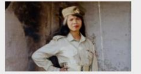
The long ordeal of Asia Bibi